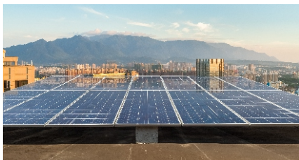
Commercial building & factory rooftop