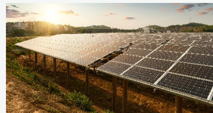
Ground-mounted photovoltaic power station